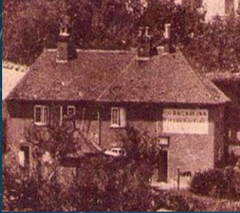
The Railway Inn